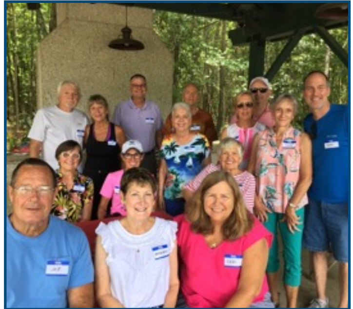
LPC'ers who live in Hampton Lake enjoyed a picnic together in June, and included the Herrins.