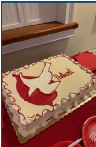
LPC celebrated Pentecost, the birth of the church on May 28th with a birthday cake hosted by the Worship Team.