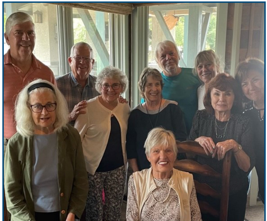
Members of the Spring 2022 New Member Class enjoy brunch together in June.