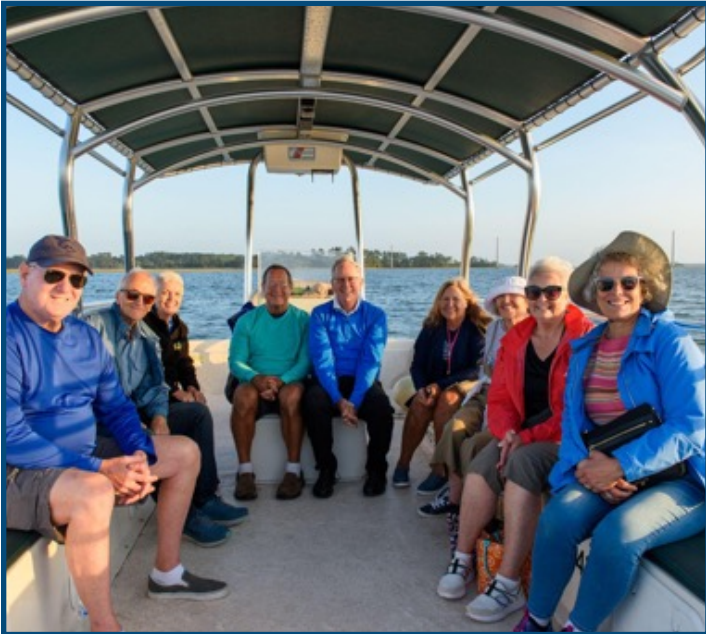
LPC members from the Seekers small group on a sunset cruise on the May River on May 15th.